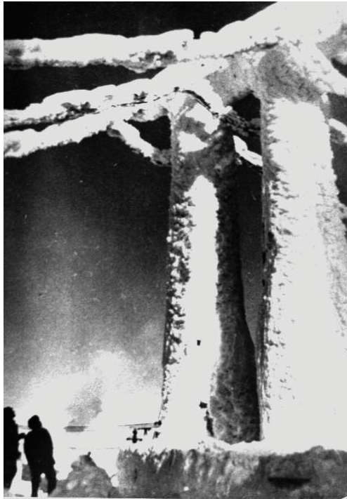
Figure 1- Condition of a transmission line after a snow storm in Pavlodar oblast

At turbine rotation there is a centrifugal force |\vec{F}| = \rho\omega^2 l_1 (where \rho - air condensation, \omega - angular speed of rotation of the turbine, l_1 - length of a move), there are apertures in atmosphere on which ends directed along mach towards working blades.